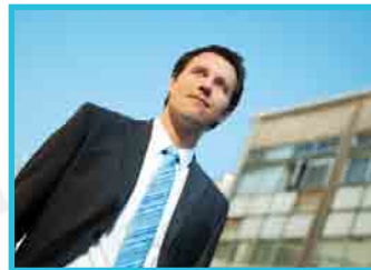
Logistics Manager Turbine Manufacturing Plant

“You guys did such an amazing job finding the perfect solution and reduced costs significantly.”