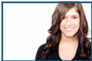
Shipping Coordinator Parts Distribution Warehouse

"The [Valley Box's crew is] also able to support emergency needs ...without affecting the support in our other areas."