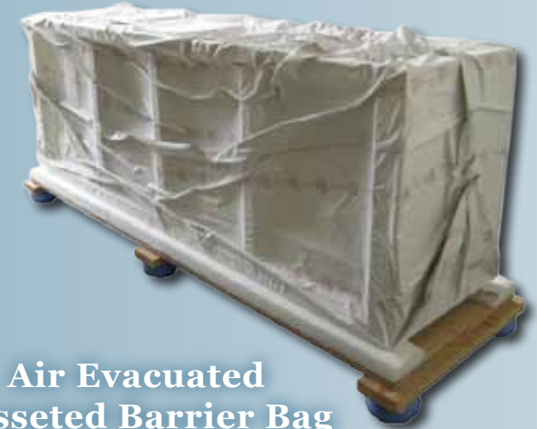
Air Evacuated Gusseted Barrier Bag