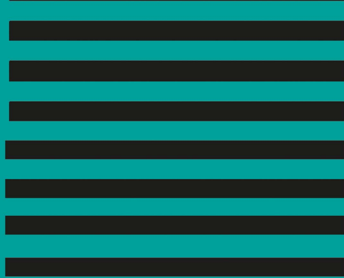
Alternative Molded Case