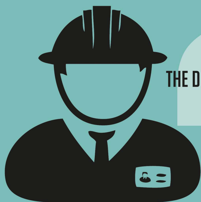
Project Engineer Aircraft Systems Manufacturer

THE DESIGN & CONSTRUCTION OF THE CONTAINER