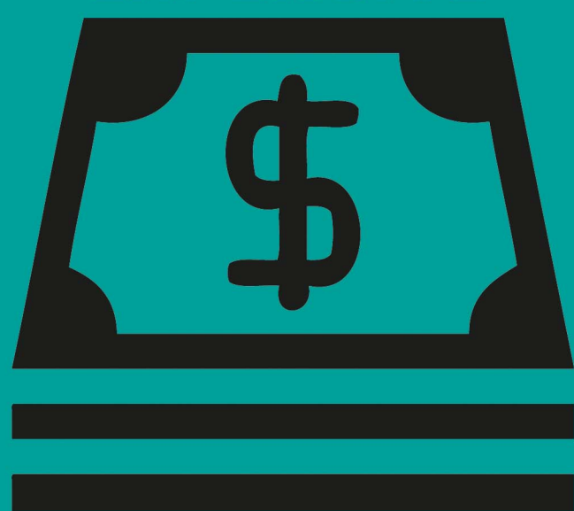
VBC's Reusable Container